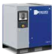
Floor Mounted version without integrated dryer