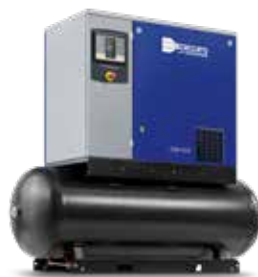
Tank Mounted version with integrated dryer